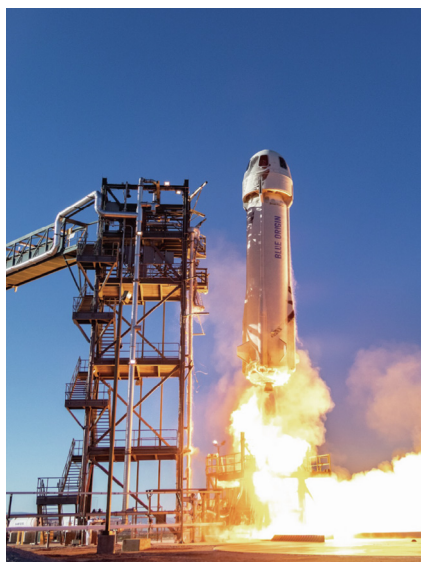
Fig. 3. Blue Origins New Shepard capsule launches aboard its reusable booster rocket, carrying a payload of nine NASA experiments, on 23 January 2019. Note the large viewing windows on the capsule.

The New Shepard can also eject itself from the booster rocket during the initial ascent should an emergency occur [13], a feature that underscores how risky such space travel remains, despite its