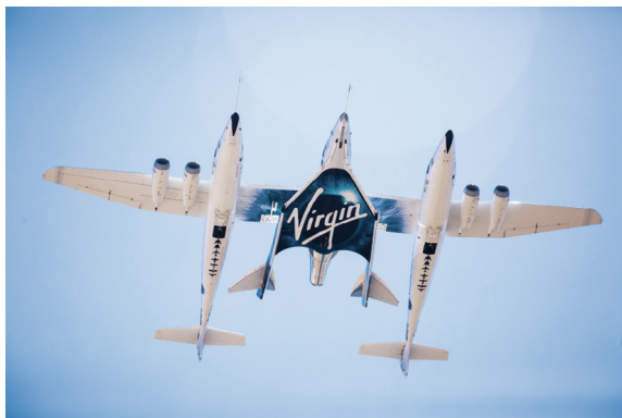
Fig. 1. Virgin Galactic's carrier aircraft VMS Eve shuttles the spaceplane VSS Unity on a test flight.